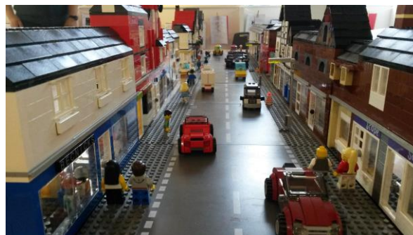
Photo of Brook Street constructed in Lego

Year 6 pupils from Oldfield Primary school in Vicars Cross, Hoole CE Primary School and Chester Bluecoat CE Primary School were treated to a fantastic Lego model of Brook Street. Last year when the children were in Year 5, they were learning about the stories of the street's traders and residents. Pupils also spoke to the artist behind the model who said that the entire display had taken 4-5 months to create and included custom painted signage on the bricks.